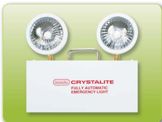
“CRYSTALITE” Cat. CE-LED-2X3W-N